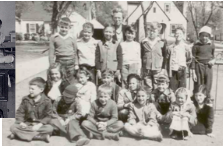
Class of '57 on Mark Twain playground. Yr. unknown.