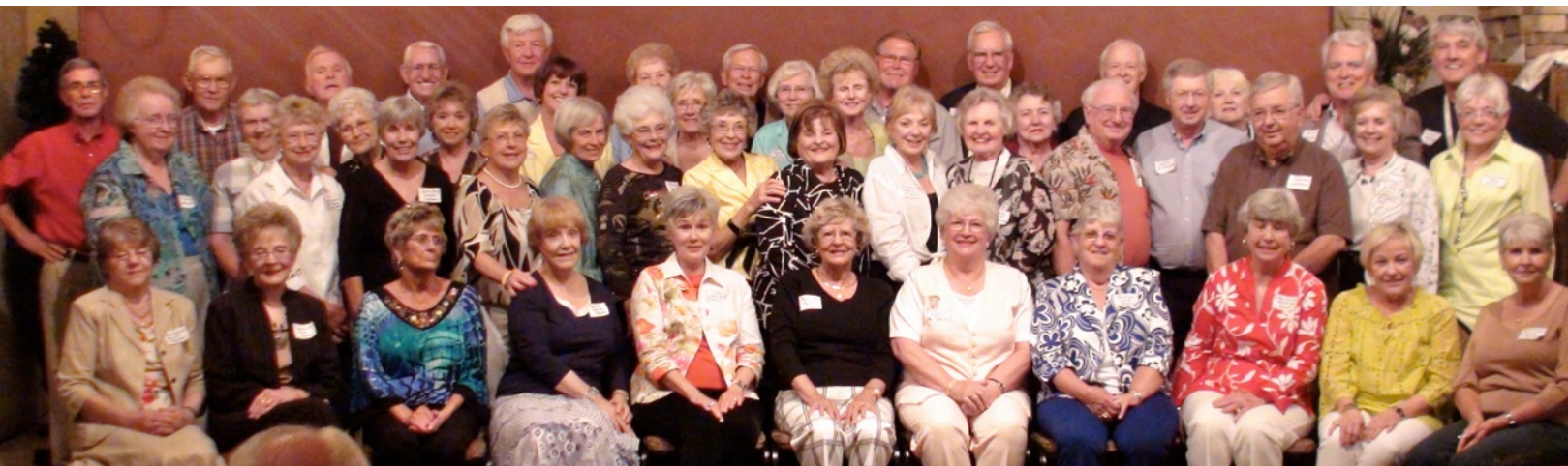
Washington High School's Class of 1954